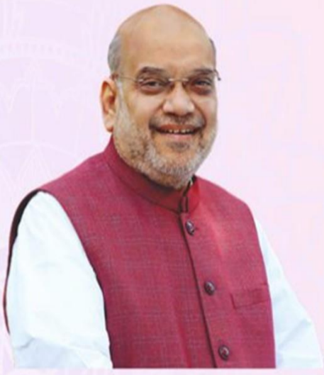
Chief Guest Sh. Amit Shah Honourable Union Minister for Home and Cooperation, Govt. of India